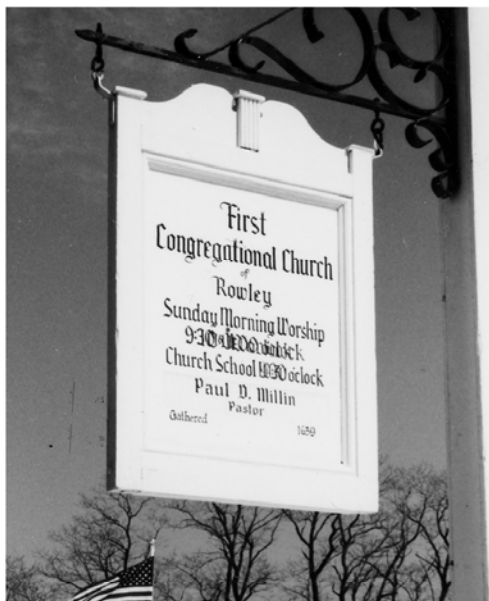
The First Congregational Church of Rowley, Massachusetts, founded 1639